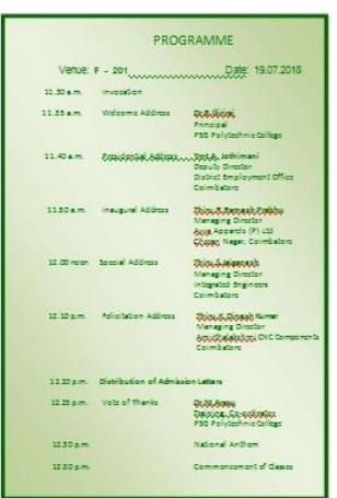
Invitation of Inaugural Function